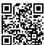
Covenant Program Website